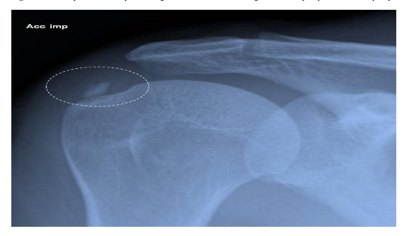
Figure 2: Anteroposterior X-ray of her right shoulder demonstrating calcified supraspinatus tendinopathy