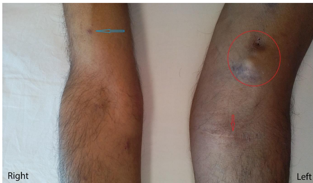
Figure 1: Fistula in left arm and needle marks on right arm. The red arrow shows the scar from surgery in the left cubital fossa. Recent puncture marks over the draining vein of the left arm fistula are enclosed in a red circle. Blue arrow points to puncture marks over the right upper arm.

Cite this Article: Arshad AR, Islam F, Qayyum M. Iatrogenic brachiobasilic fistula in a hemodialysis dependent patient. J Pioneer Med Sci. 2021;10(1):8-9