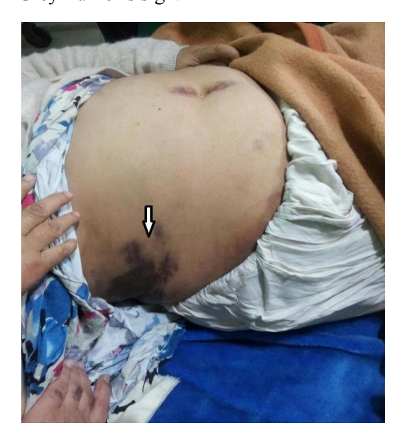
Figure 2: A lateral image of the abdomen; the white arrow points to an ecchymotic discoloration of the flank termed as the Grey Turner's sign.