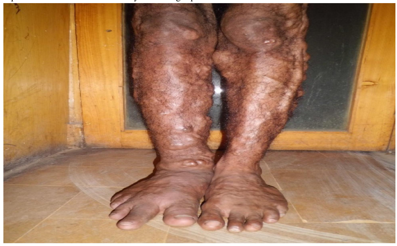
Figure 2: Hard bony outgrowth on the medial aspect of the left knee