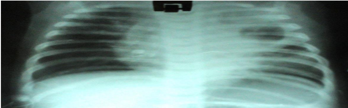
Figure 1: Chest x-ray (PA view) showing consolidation with a large cavity in the left upper zone

tubercular therapy drugs (ATT) with daily isoniazid 50mg, rifampicin 50mg, pyrazinamide 125 mg, ethambutol 75mg for 2 months and isoniazid 50mg, rifampicin 50mg for last 4 months month. Fever subsided after 7 days of ATT and we discharged the child after 10 days in stable condition. Subsequently report of mycobacterial BACTEC culture came as positive and showed growth of Mycobacterium tuberculosis . At follow up after 8 weeks of ATT therapy, the child was doing well, asymptomatic and had radiological improvement of follow-up chest x-ray [Figure 3].