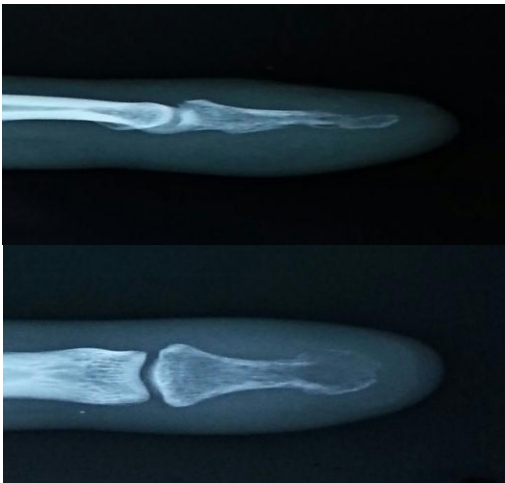
Figure 3.1 and 3.2: CT Scan demonstrating lytic lesions with eroded cortex in distal phalanx of the affected left middle finger