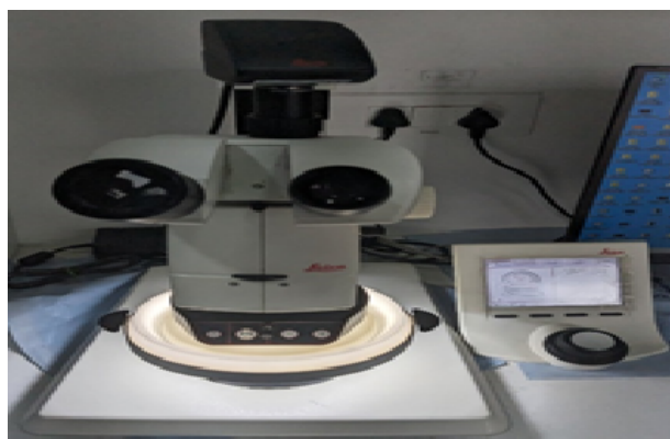
Figure 2: Microleakage assessment using stereomicroscope

stereomicroscope (LEICA M205C) [Figure 2,3] and scored by an examiner who was blinded to the study. Ovrebo and Raadal [19] guidelines were used to assess the microleakage and the interpretation of the scores.