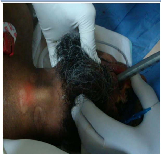
Figure 4: showing the light glow at the level of suprasternal notch