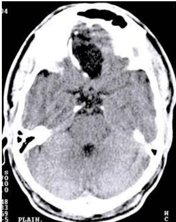
Figure 2: Unenhanced CT scan brain (axial section) of patient 2, showing a hypodense mass lesion in the fronto-basal location, mainly on the right side. Right lateral wall of cyst is lined with calcifications.