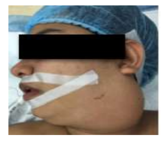
Figure 2: Intraoperative view of the giant anterior neck lipoma with retracted subplatysma skin flap.

Figure 1: A giant lipoma of the anterior neck measuring 11.0cm x 6.0cm