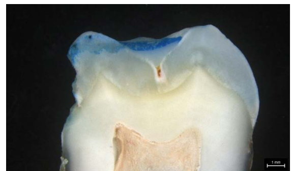
Figure 6: Microleakage Image of Group-II