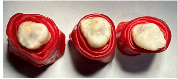
Figure 1: Group I-Flowable composite

The in-vitro analysis was conducted in the White Research Lab at Saveetha Dental College under controlled conditions to minimize variability.