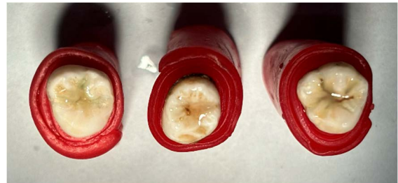
Figure 2: Group II- Hydrophilic Sealant