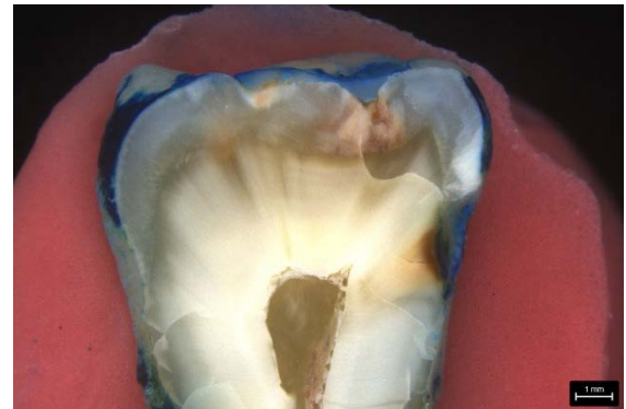
Figure 5: Microleakage Image of Group-1

The microleakage scores demonstrated significant differences between the two tested groups. In Group I (hydrophilic sealants), four samples recorded a microleakage score of 0, indicating no dye penetration, compared to only one sample