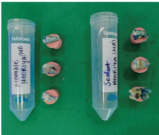
Figure 4: Dye Penetrated Samples

distributions of the microleakage scores were calculated for both groups. Comparisons between groups were performed using the Mann-Whitney U test, with a significance level set at p < 0.05 .