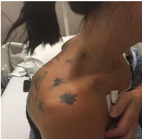
Figure 1: Acupunctures on areas marked X