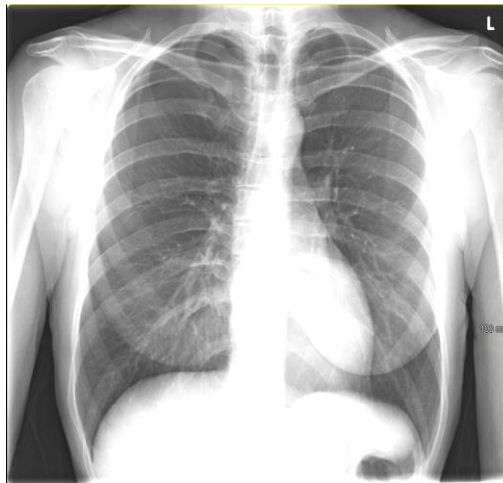
Figure 2: Apical pneumothorax on X ray