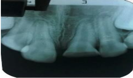
Figure 3A: Fragmented Segment