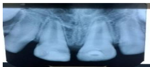
Figure 9B: 6 months IOPA X-Ray