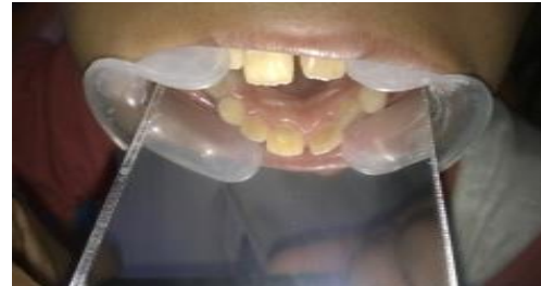
Figure 8A: 12 months follow up