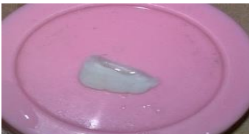
Figure 3B: Fractured Segment